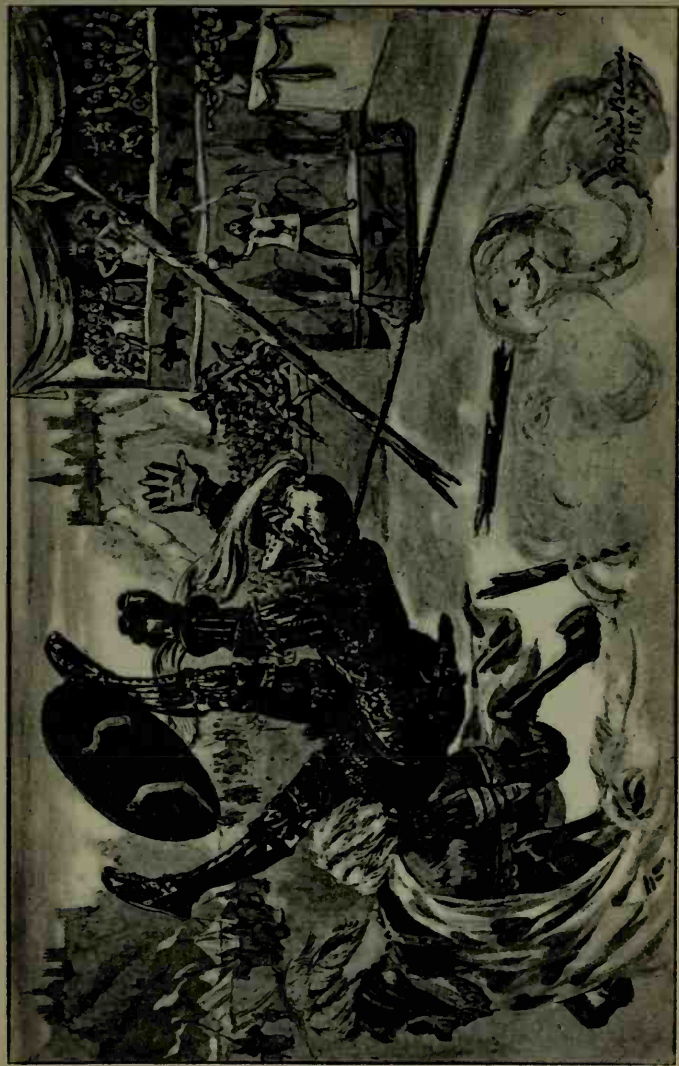
Great Scott, But There Was A Sensation!